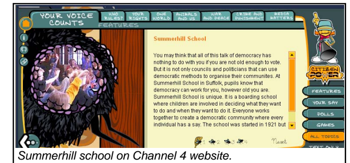
Summerhill school on Channel 4 website.

Eight primary schools, their teachers and students took part in training at the PDC on 'Active Citizenship and Democracy in Primary School' this term.