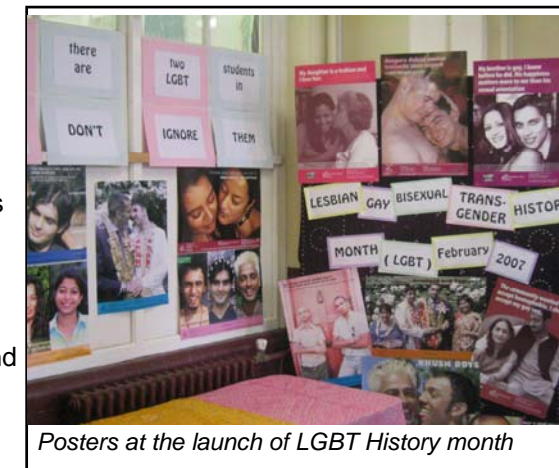
Posters at the launch of LGBT History month

East End Eye is a website created by and for secondary age students in Tower Hamlets to reflect their diversity and explore identities. As citizens of the world and the East End of London, the site is a space for them to share their thoughts and ideas, have their voices heard and celebrate their actions and creativity.