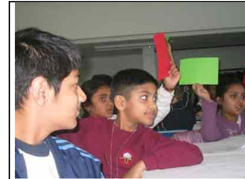
Children voting at the Children's Act 2007 event at the Rich Mix Centre.

As part of the borough's implementation of the Children's Act, Every Child Matters and the agenda for the Children and Young People's Plan, the Youth Participation Team and HEC are currently working together in trying to get more young people engaging with both educational and community opportunities to participate and have a say in matters that affect them.