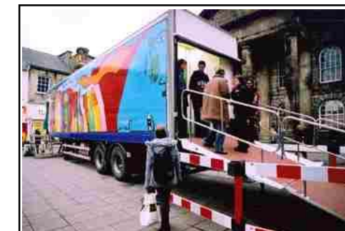
The trailer multimedia exhibition Escape to Safety at the PDC 1-11 May. Book now.